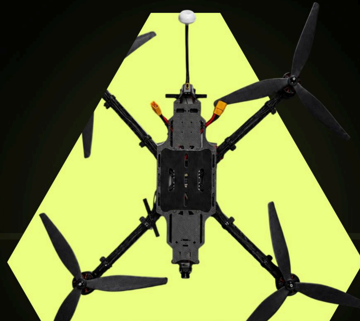
GUST (SR-02) — mass FPV interceptor · meets threats in numbers